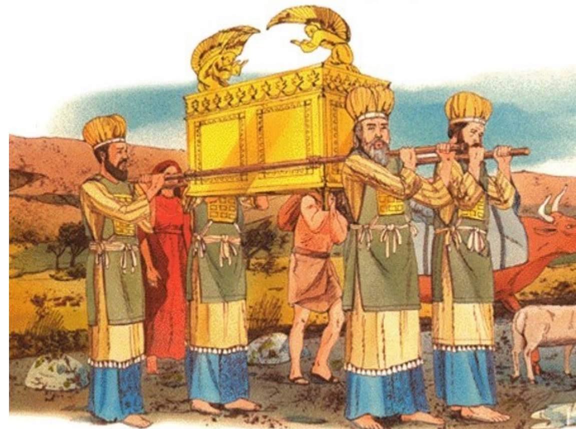
Hebrew Ark of the Covenant carried by the priests of Israel